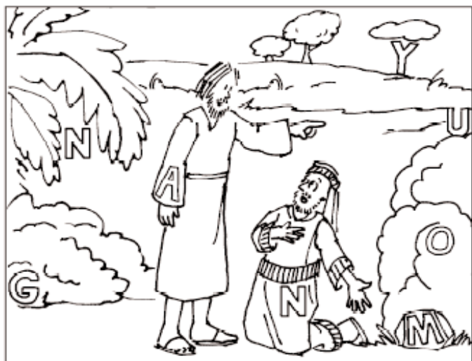
St. Mel Children's Corner