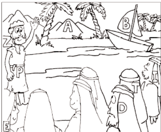
St. Mel Children's Corner