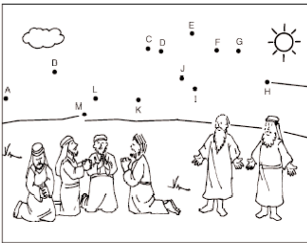
St. Mel Children's Corner

Connect the dots to find out where they were. A B C D E F G H I J K L M